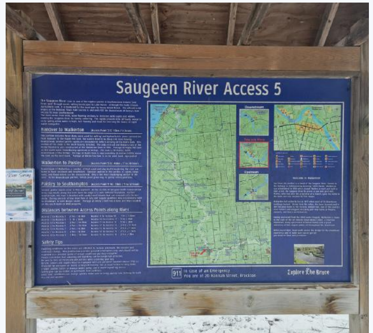
Access Point # 5