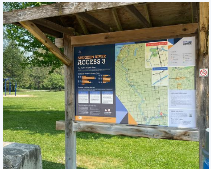
Access Point # 3