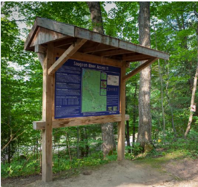
Access Point # 11