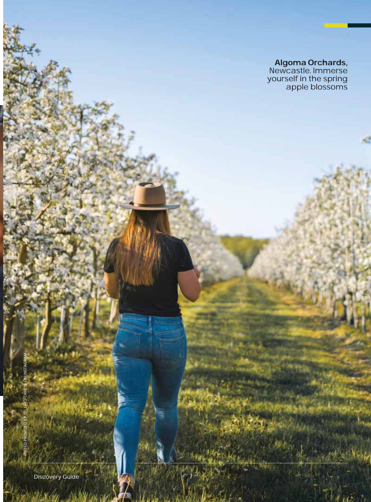
Algoma Orchards, Newcastle. Immerse yourself in the spring apple blossoms