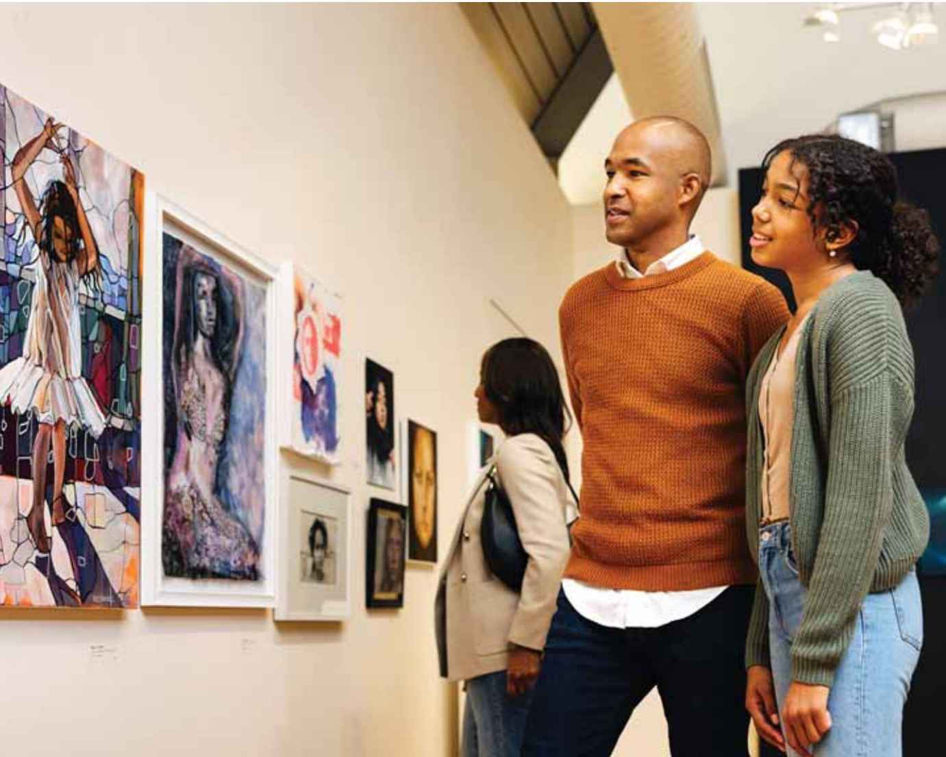
▲ Station Gallery, Whitby