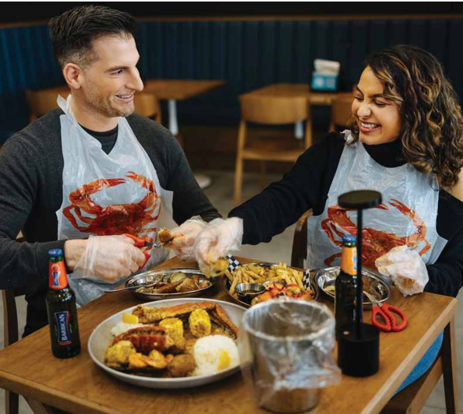
Sea Salt Seafood Cafe, Ajax