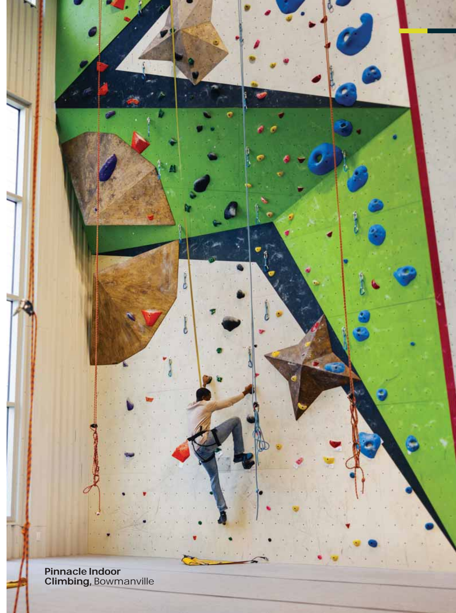
Pinnacle Indoor Climbing, Bowmanville