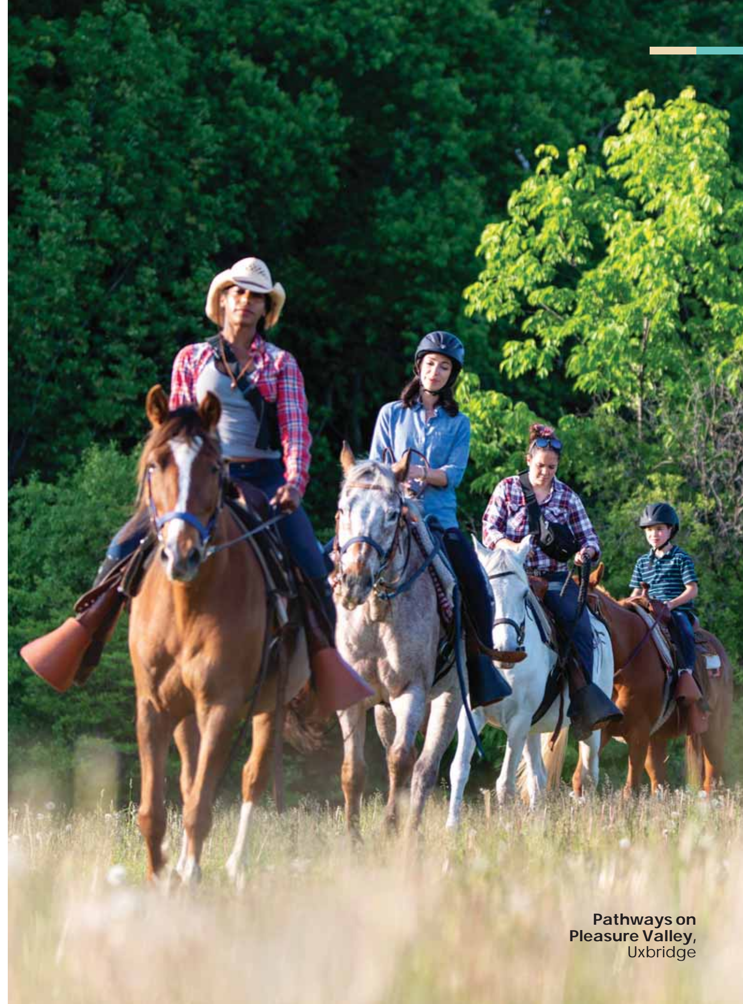
Pathways on Pleasure Valley, Uxbridge