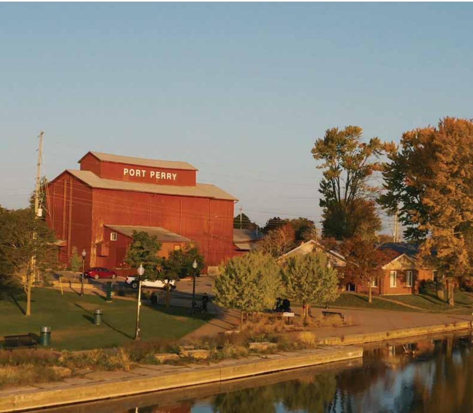
▲ Palmer Park on the shores of Lake Scugog, Downtown Port Perry