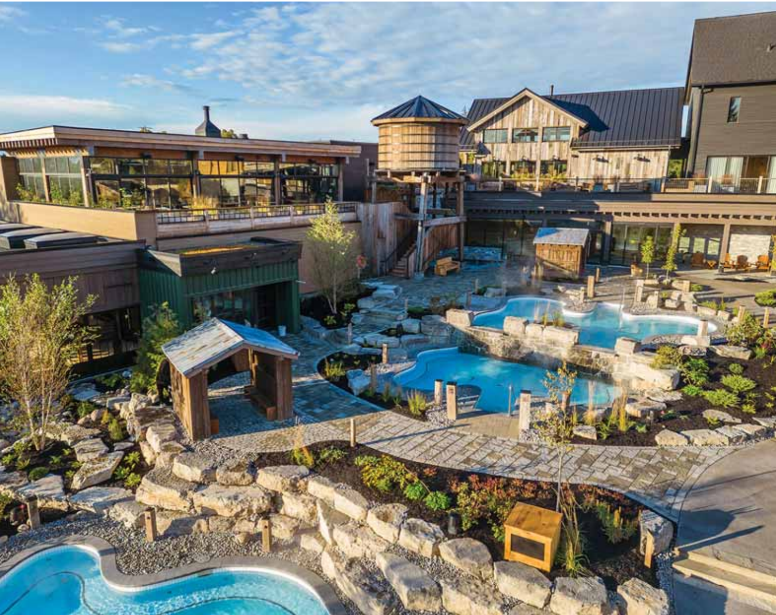
▲ Thermëa spa village, Whitby