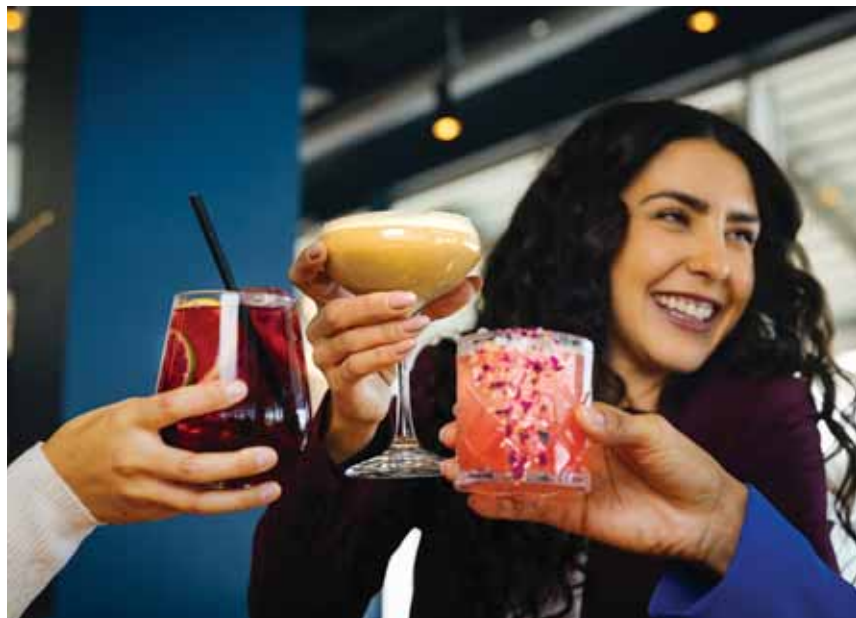
▶ Port Restaurant, Pickering

(OPPOSITE) PHOTO PROVIDED BY @CAPTUREDBYSAGE ON INSTAGRAM