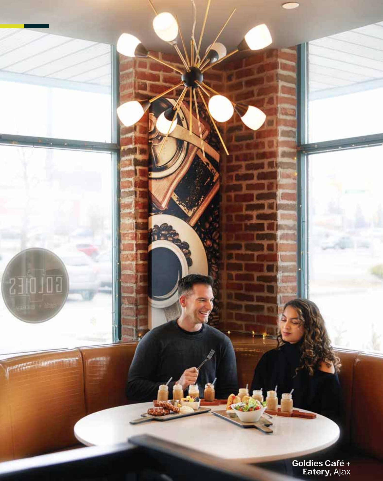
Goldies Café + Eatery, Ajax