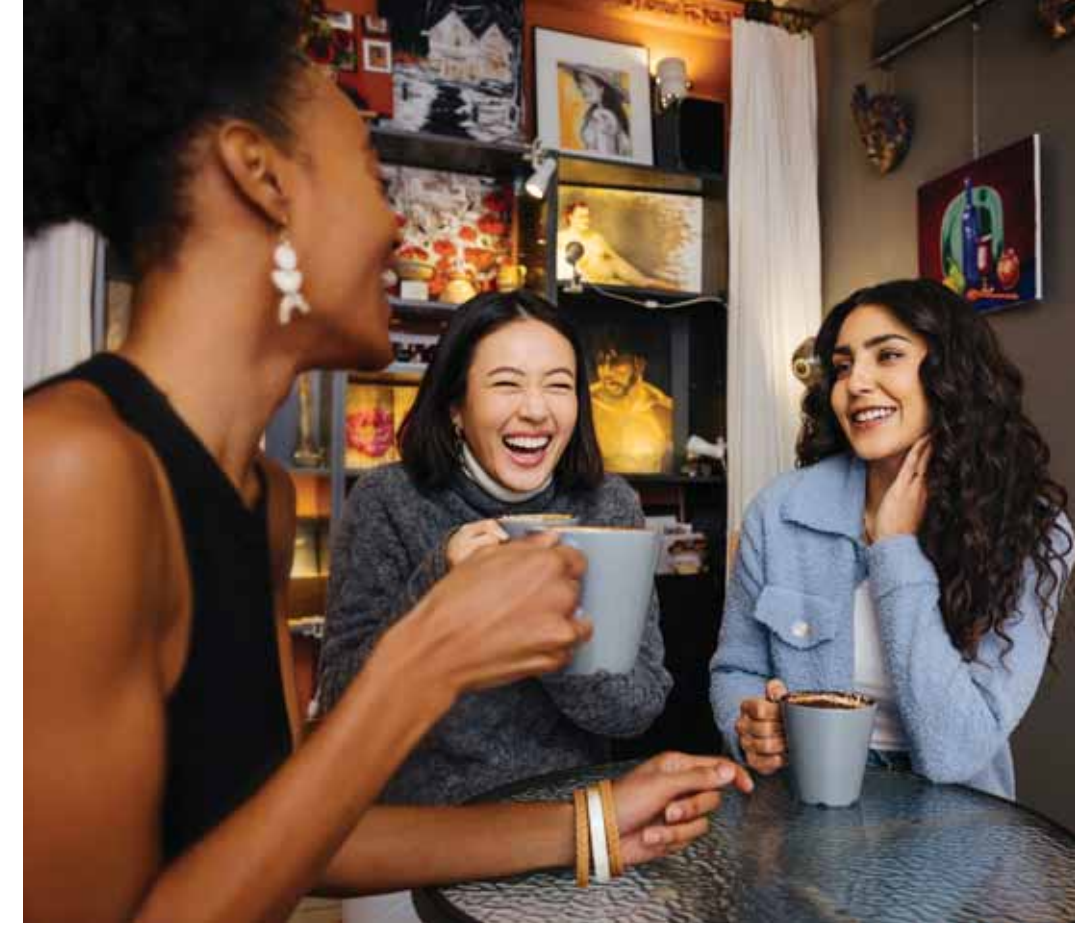
Open Studio Art Café, Pickering Nautical Village