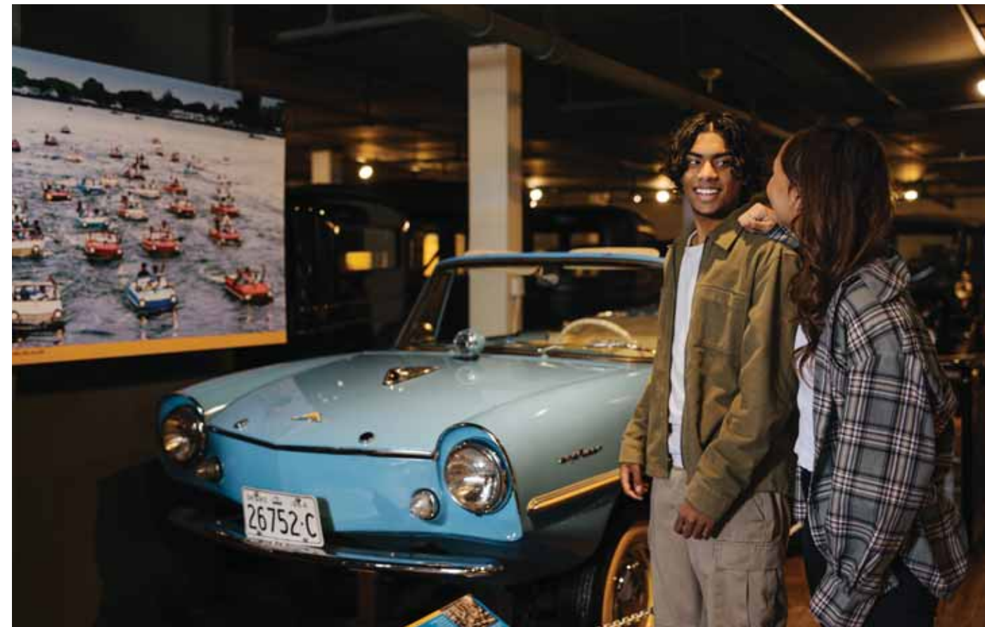
Canadian Automotive Museum, Oshawa