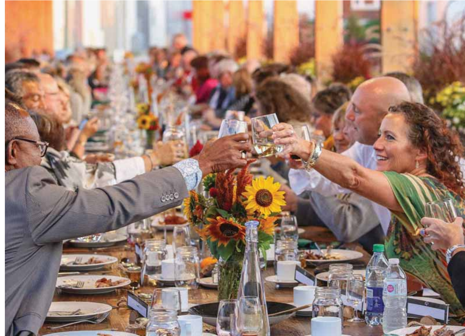
▲ Harvest Dinner at the W. Galen Weston Centre for Food, Whitby