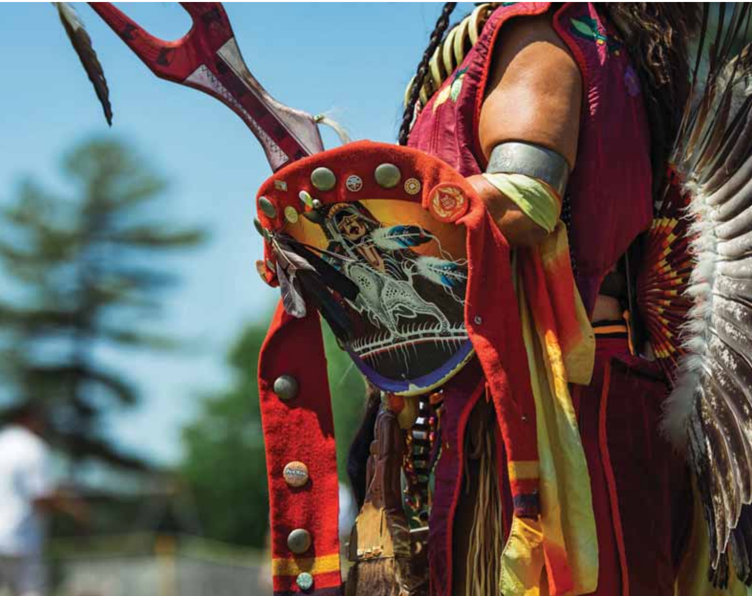
▲ Mississaugas of Scugog Island First Nation Pow Wow, Scugog Island