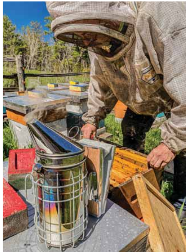
▶ Villa Vida Loca Market, Sunderland

Find both of these locations on the Backroads of Brock