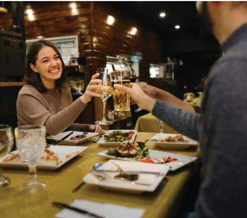
◀ Stefano's Bistro, Downtown Beaverton