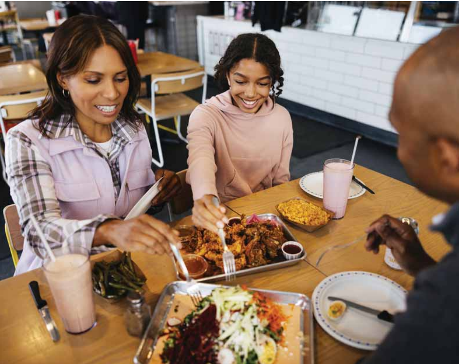
Butchie's, Whitby. Find more great places to eat in the Whitby Food Guide