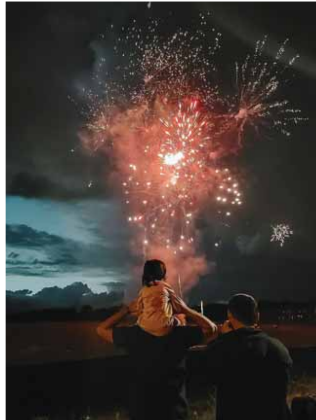
Victoria Fields Park, Whitby

(OPPOSITE) PHOTO PROVIDED BY YORK-DURHAM HERITAGE RAILWAY. (TOP) PHOTO PROVIDED BY @QUEENSCOMMONWEST ON INSTAGRAM