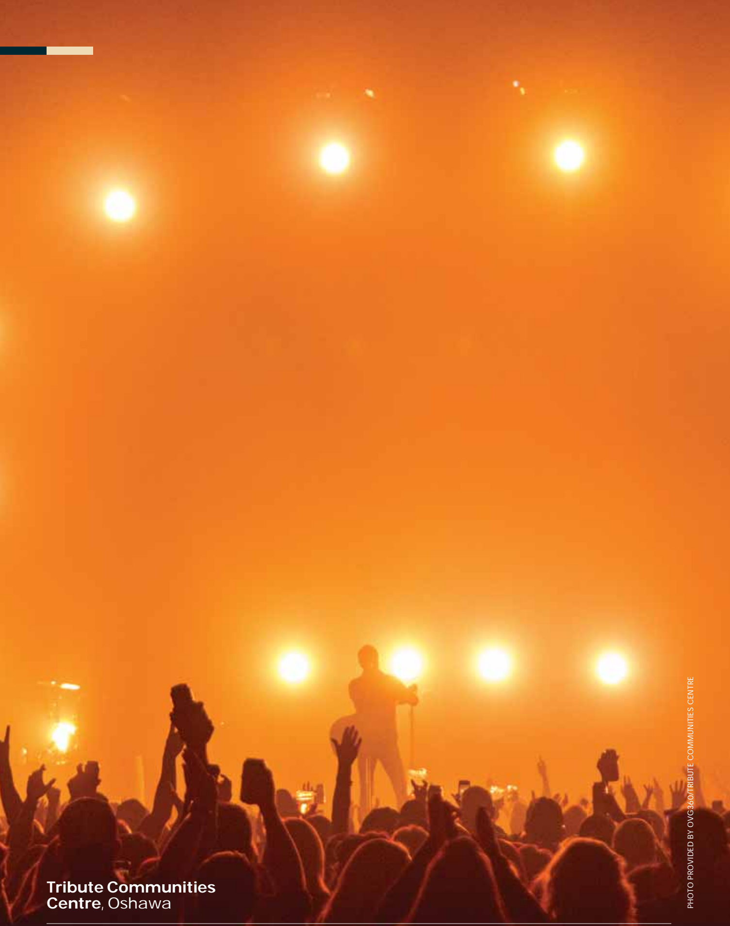
Tribute Communities Centre, Oshawa