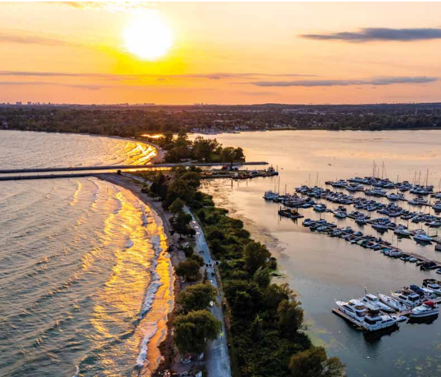
Frenchman's Bay, Pickering