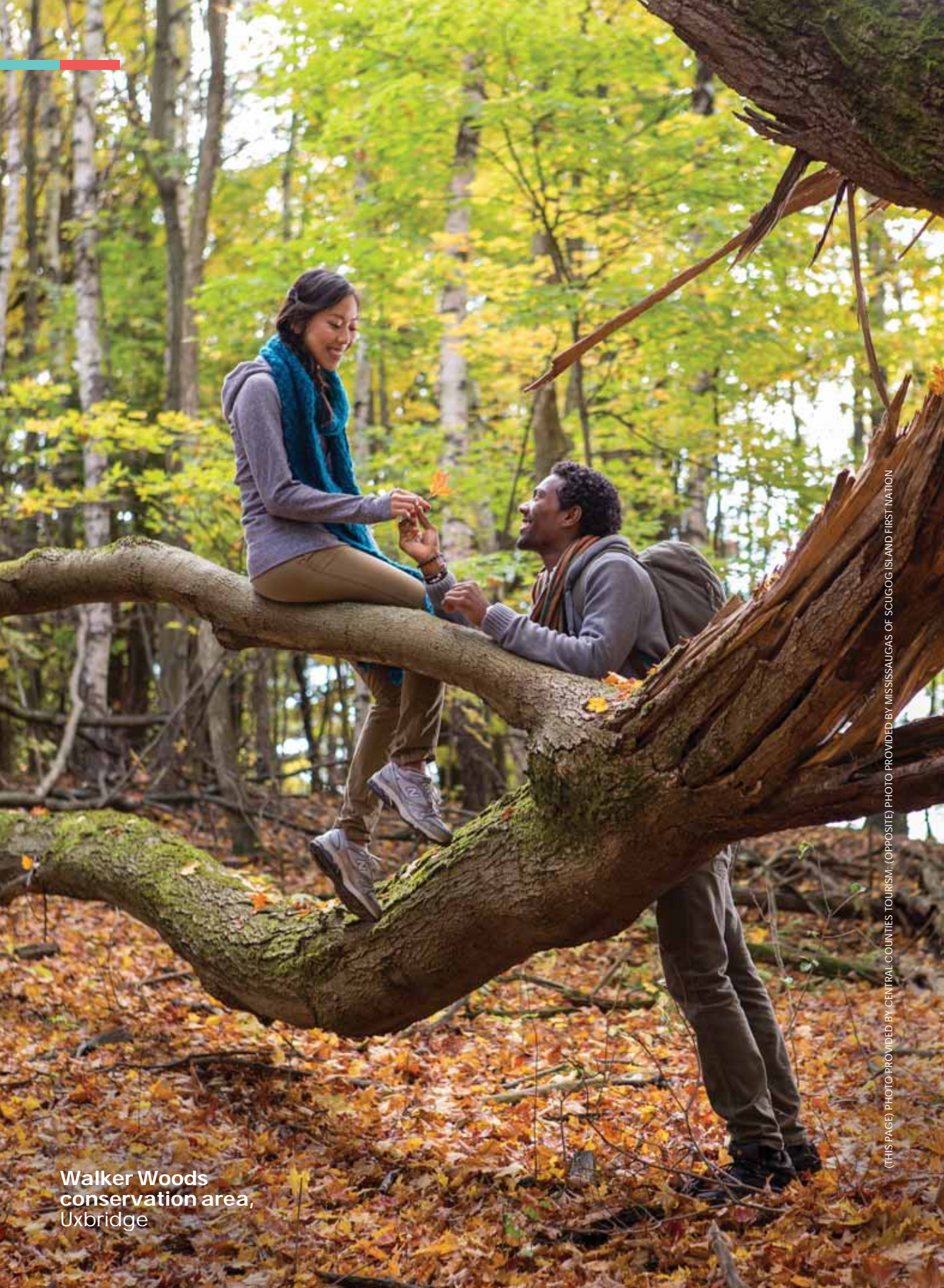
(THIS PAGE) PHOTO PROVIDED BY CENTRAL COUNTIES TOURISM; (OPPOSITE) PHOTO PROVIDED BY MISSISSAUGAS OF SCUGOG ISLAND FIRST NATION