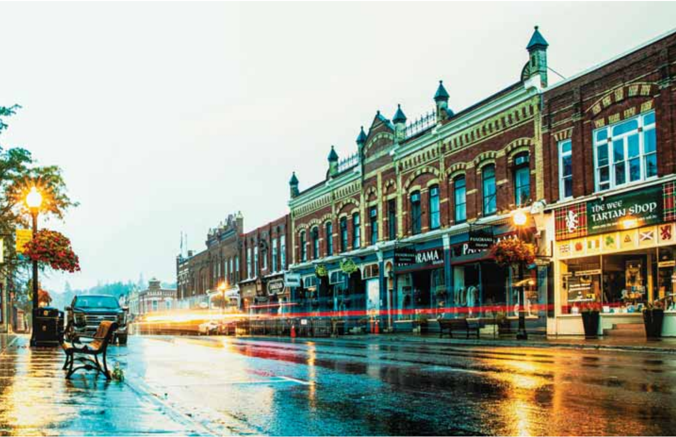
▲ Downtown Port Perry