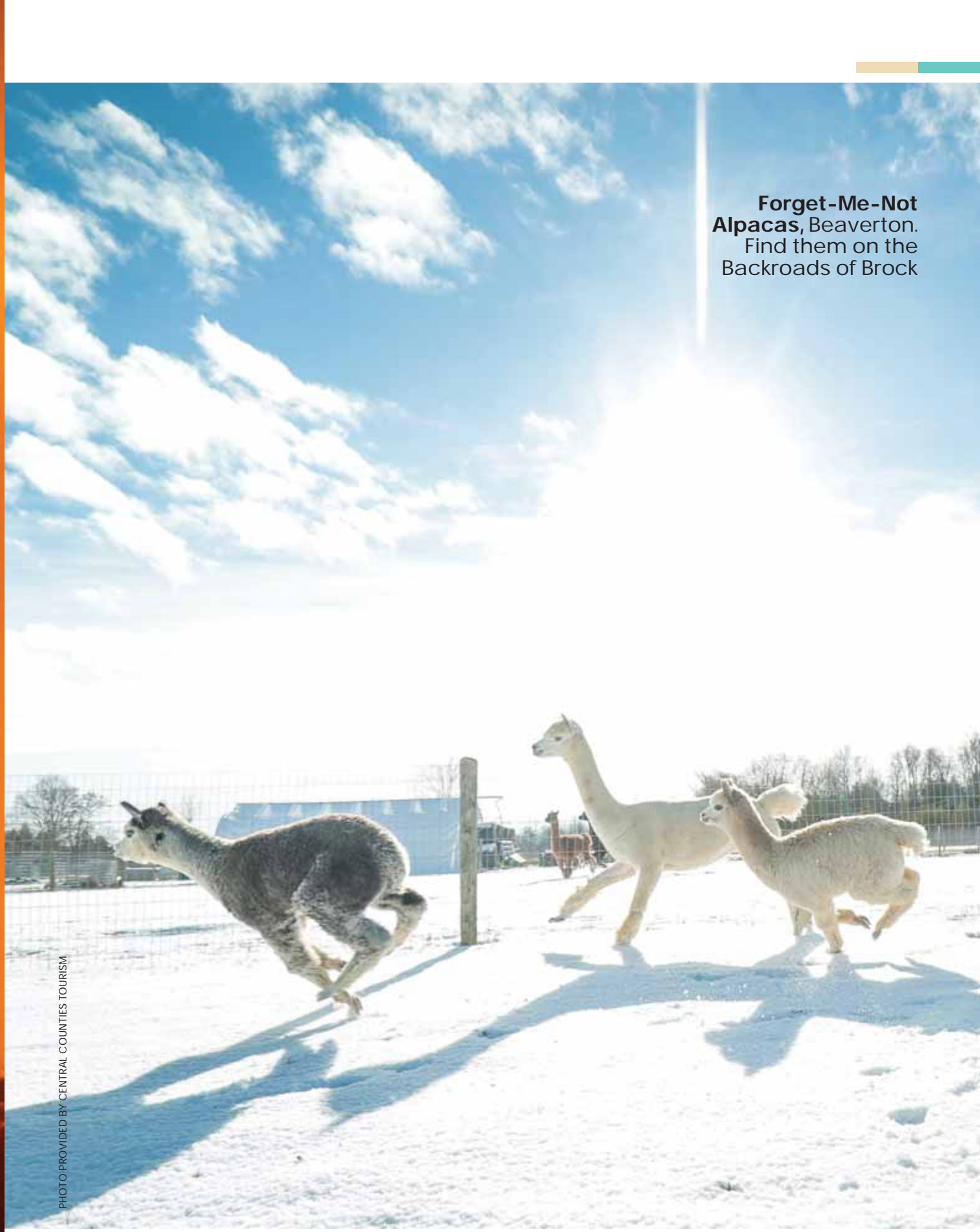
Forget-Me-Not Alpacas, Beaverton. Find them on the Backroads of Brock