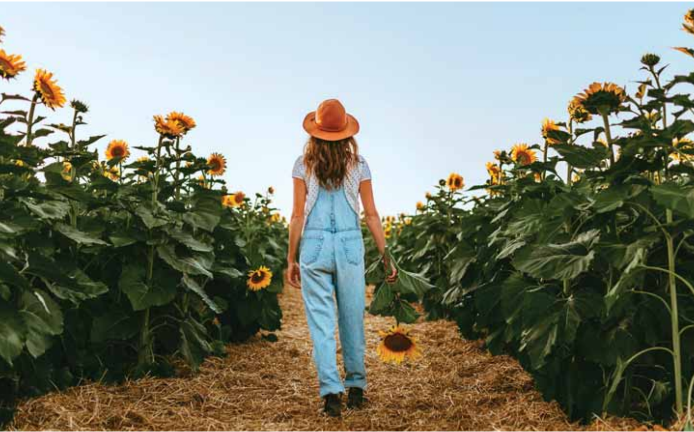
▲ The Sunflower Farm, Beaverton