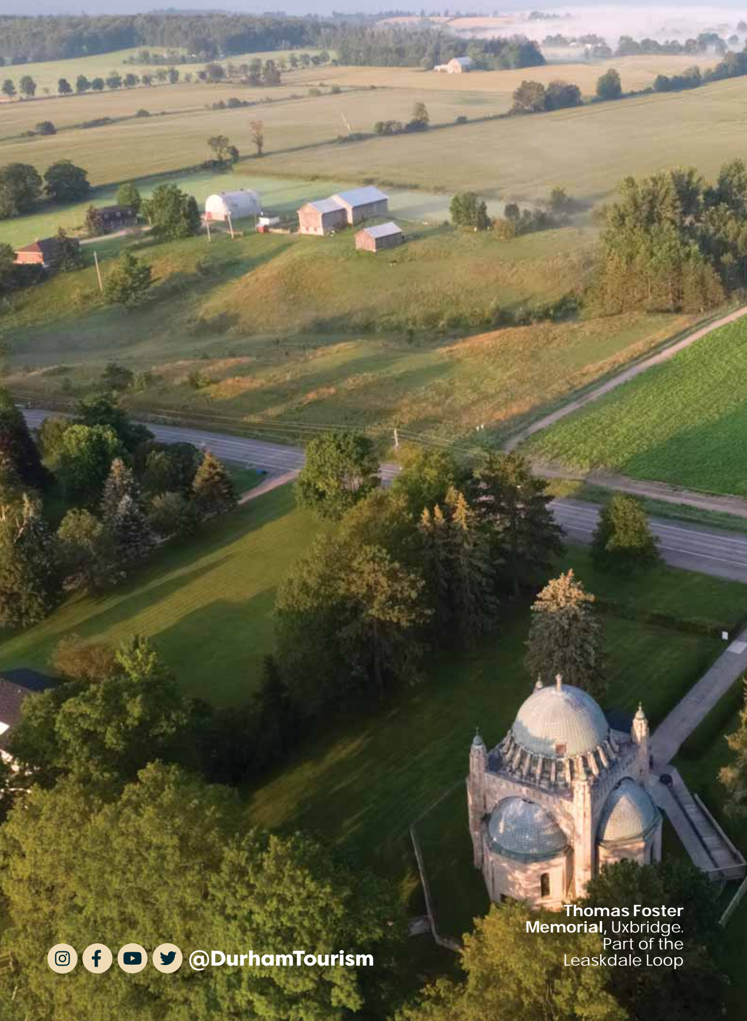
Thomas Foster Memorial, Uxbridge. Part of the Leaskdale Loop