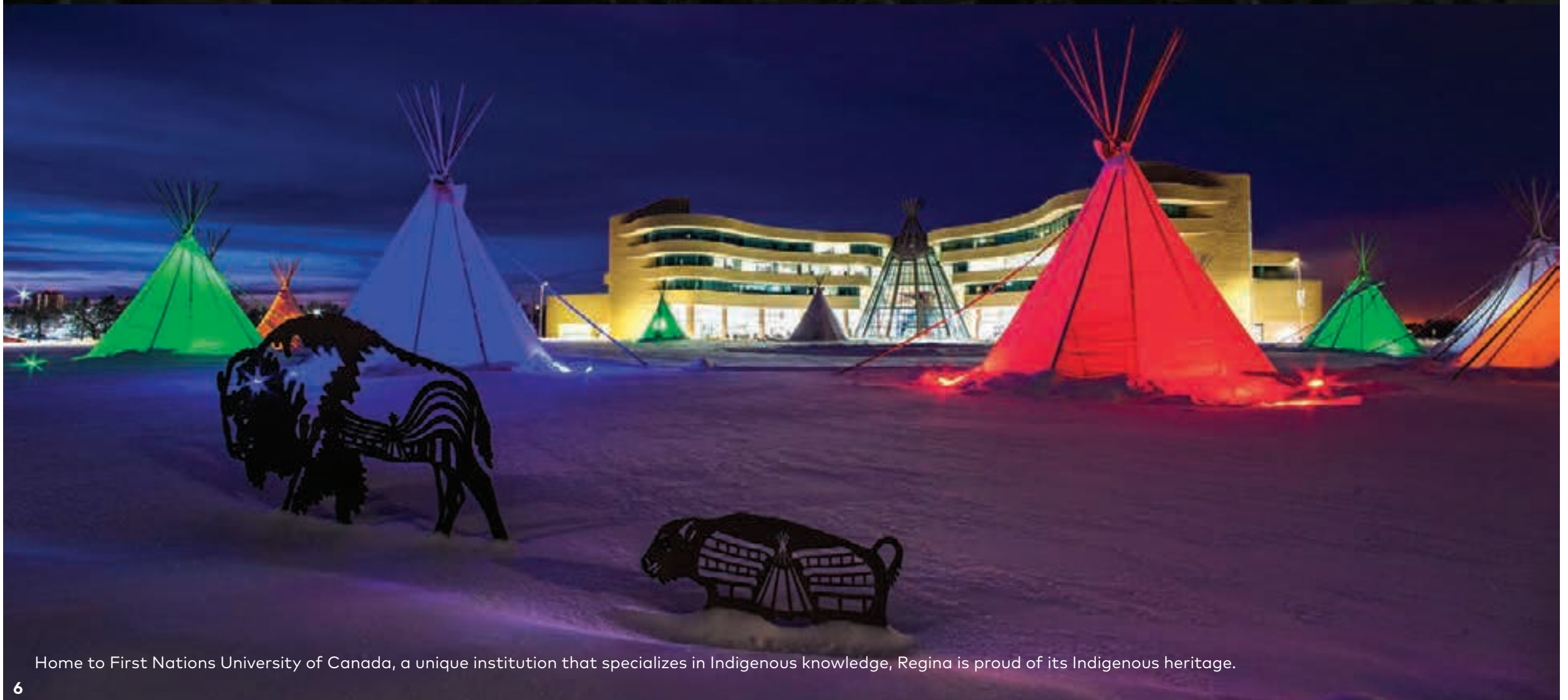
Home to First Nations University of Canada, a unique institution that specializes in Indigenous knowledge, Regina is proud of its Indigenous heritage.