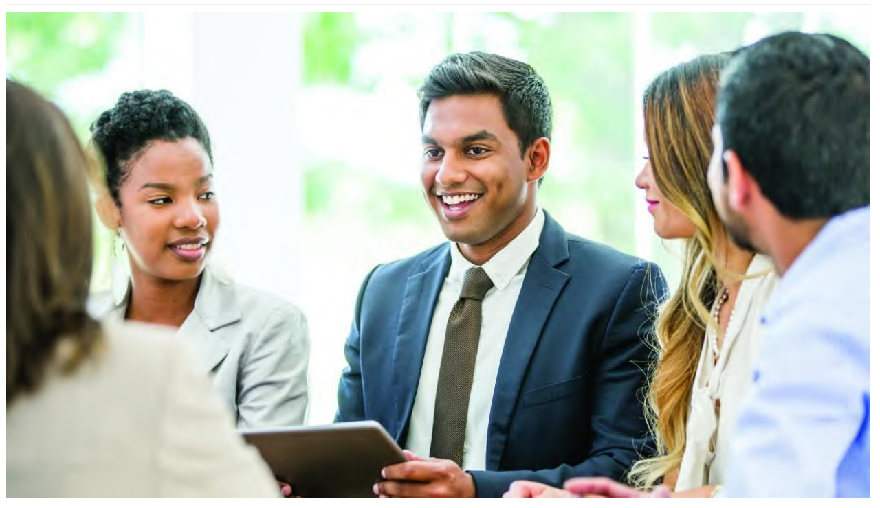
The Community Concierge program led through Careerspace at Trent aims to connect recent graduates with local and rural employers throughout the City of Kawartha Lakes and City & County of Peterborough.

Training program supports development of job search skills, facilitates local career opportunities for students and graduates