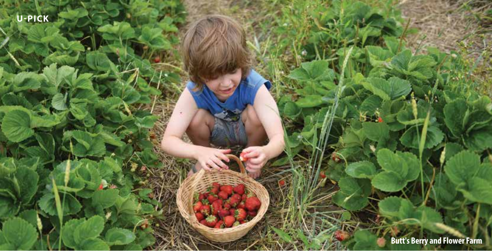
Butt's Berry and Flower Farm