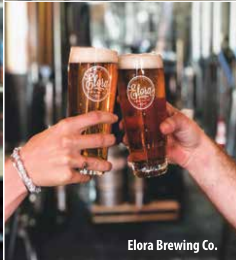
Elora Brewing Co.