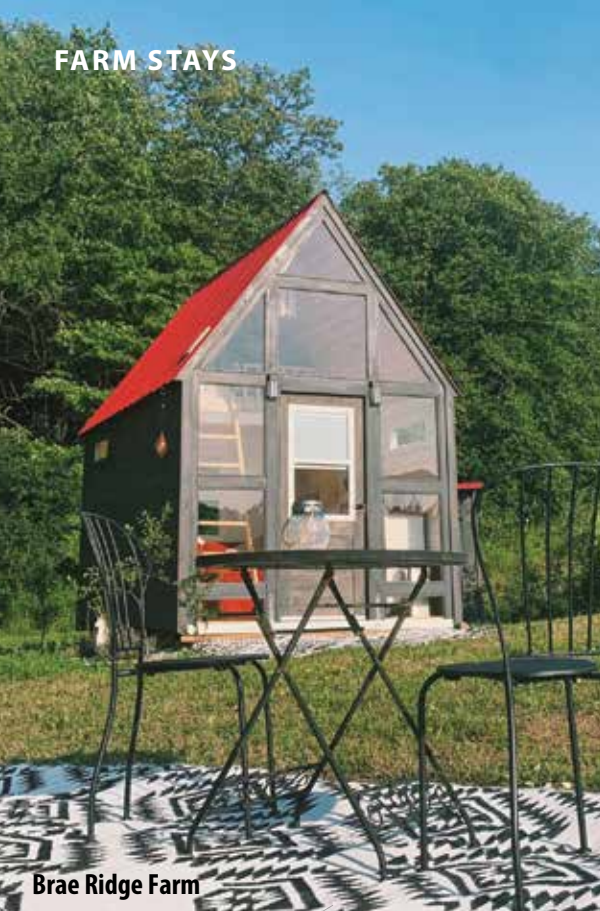
Brae Ridge Farm