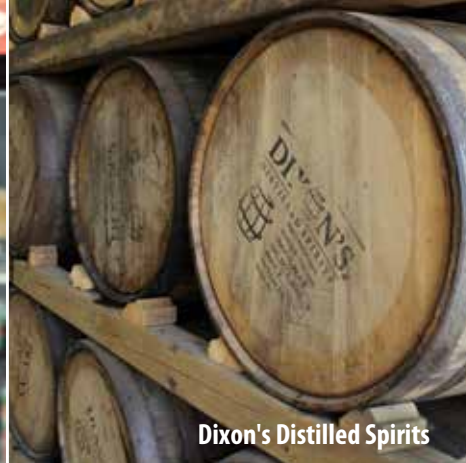
Dixon's Distilled Spirits