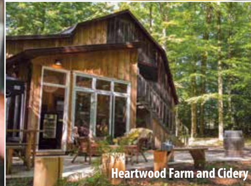
Heartwood Farm and Cidery

QUEEN OF CRAFT Passionate women using their diverse talents to teach the community about beer. www.facebook.com/queenofcraftbeer