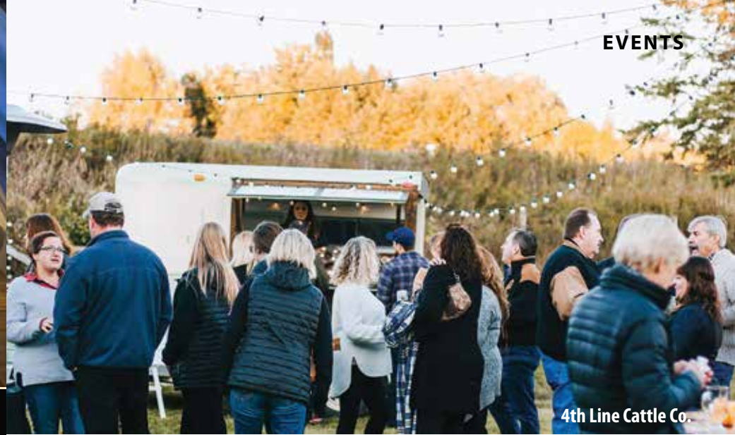
4th Line Cattle Co.