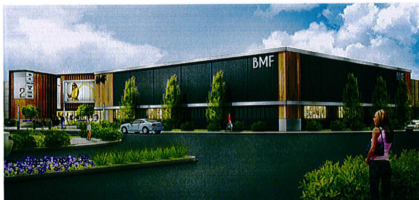
Artists' concept rendering of exterior view of the Premium Outlet Collection - Edmonton International Airport.

Located at Edmonton International Airport and adjacent to the Queen Elizabeth II highway, there will be easy access to Nisku, home of North America's second-largest energy park, and to the many great communities in the Greater Edmonton Region and beyond.