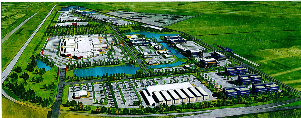
Artists' concept rendering of Highway Development area.

The Highway Commercial Project at Edmonton International Airport (EIA) is a plan to develop a premier shopping, office, entertainment and hotel park, located along the Queen Elizabeth II highway.