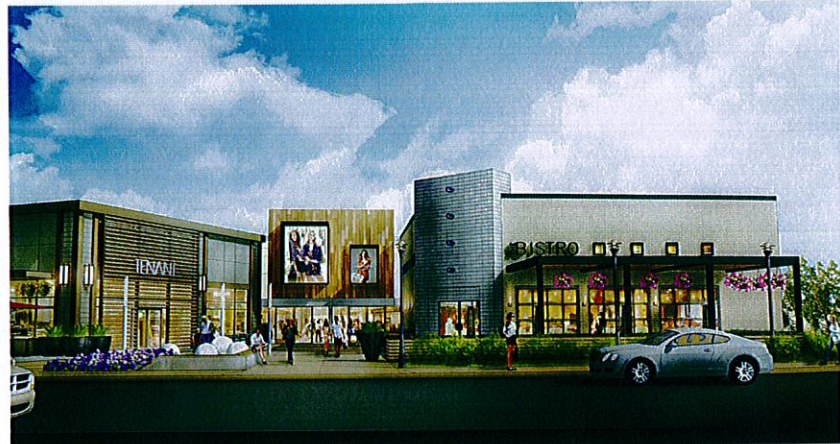
Artists' concept rendering of exterior view of the Premium Outlet Collection - Edmonton International Airport.

EIA served 8.2 million passengers in 2014. It offers non-stop connections to around 60 destinations across Canada, the US, Mexico,