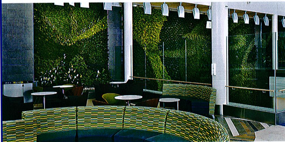
The Living Wall as seen from the new Domestic-International Departures Lounge.