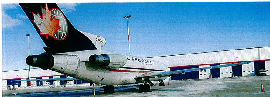
A Cargojet plane outside the hangar in EIA's Cargo Village.