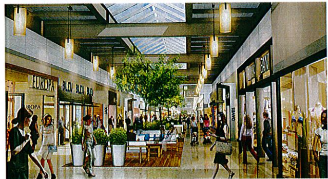
Artists' concept rendering of interior view of the Premium Outlet Collection - Edmonton International Airport.

For more information: Interested developers can contact EIA's Real Estate Development office at 780 890 8471