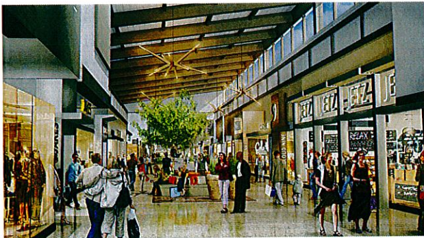
Artists' concept rendering of interior view of the Premium Outlet Collection - Edmonton International Airport. Provided by Ivanhoe-Cambridge

the Caribbean and Europe. EIA is a major economic driver for Alberta, with a total economic impact of $1.5 billion in GDP and $2.2 billion in economic output as of 2014, and approximately 12,100 direct and indirect jobs.