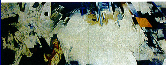
Jack Shadbolt's Bush Pilot in Northern Sky.