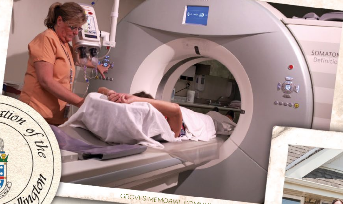
GROVES MEMORIAL COMMUNITY HOSPITAL