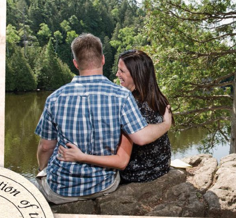
ROCKWOOD CONSERVATION AREA