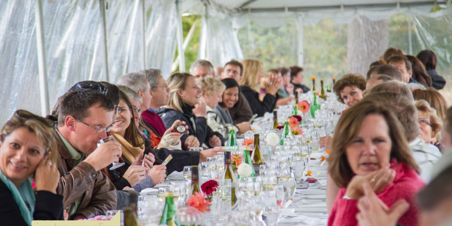
TASTE REAL FIELD DINNER