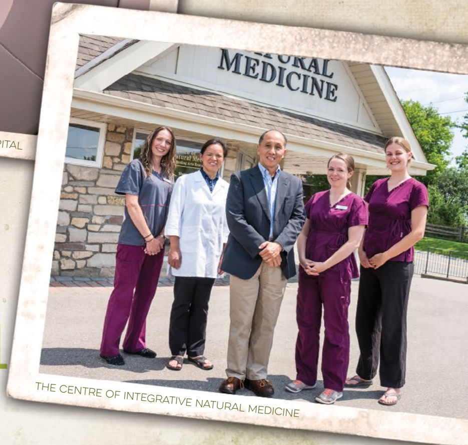
THE CENTRE OF INTEGRATIVE NATURAL MEDICINE